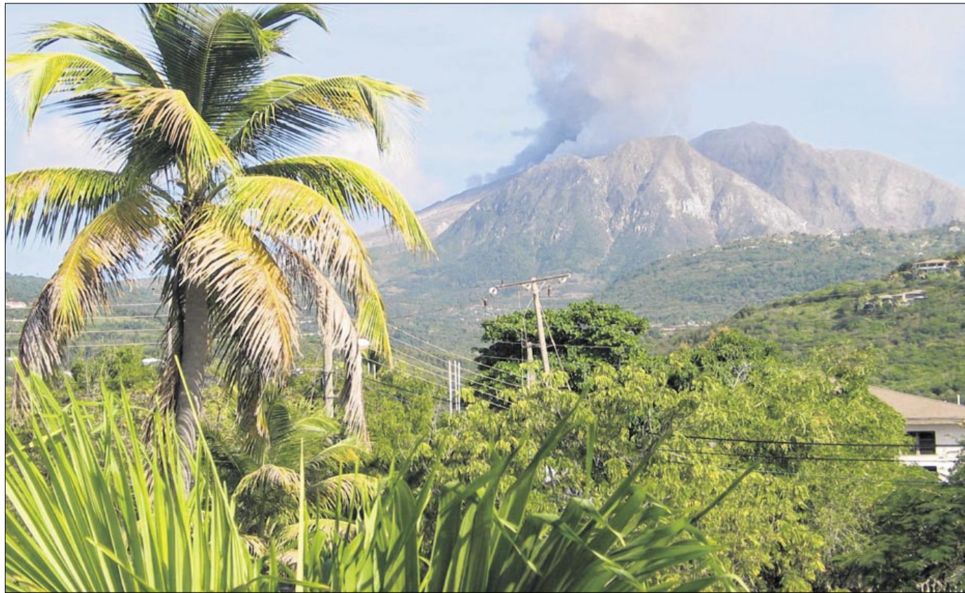
■ Montserrat's volcano rises above the lush tropical landscape